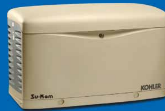
Gas Genset (7.5kVA-340kVA)