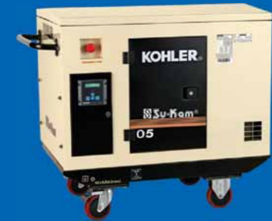
Diesel Genset (3.5kVA-630kVA)

Life is packed with the most exciting things to do. Whether it's at work or at play, spending time with the family or just relaxing on your own, you need the all-important power source to make your life complete. Which is why Su-Kam and Kohler have got together to bring you the world's very finest Kohler LPG/PNG & Diesel Generators, to give you clean, steady and hassle-free power at all times. So you can power your life with the best of experiences and never miss out on a meaningful moment again!